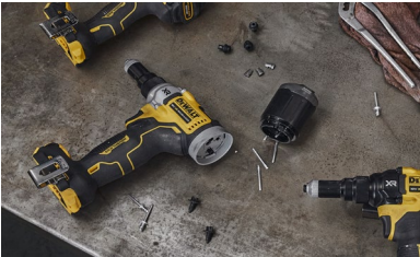
Tool-free nose piece change & on-board nose piece storage